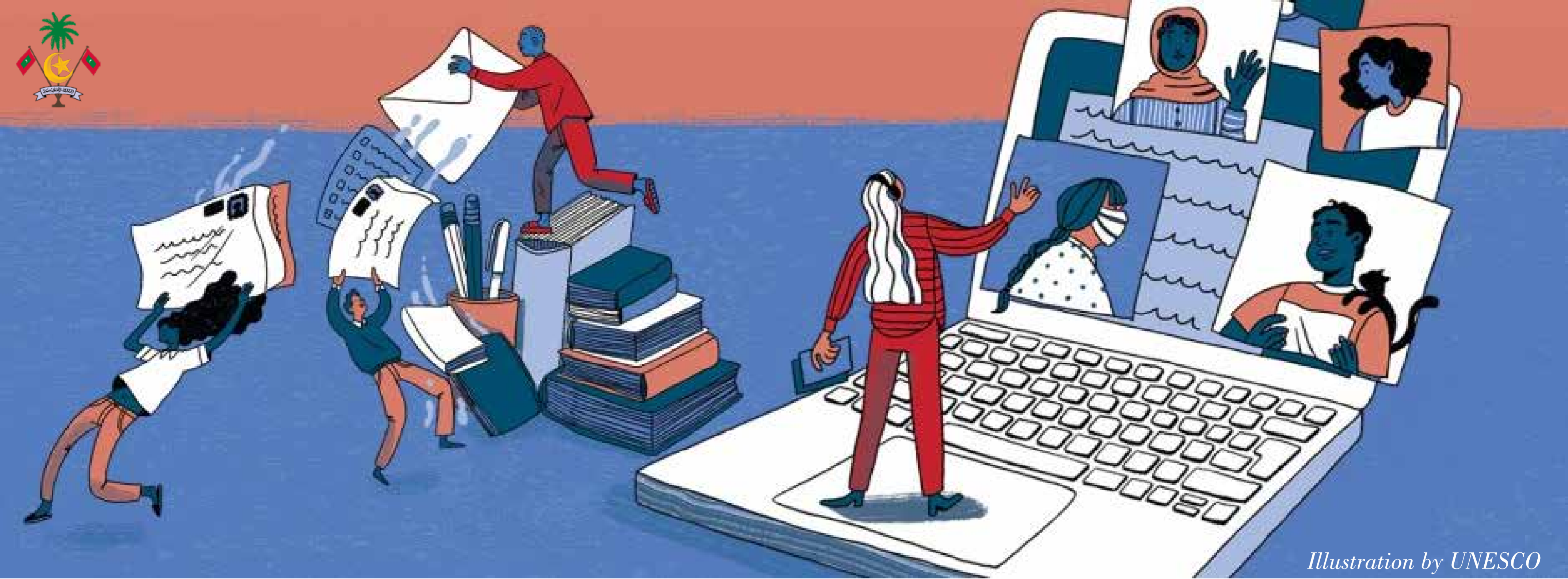
Illustration by UNESCO